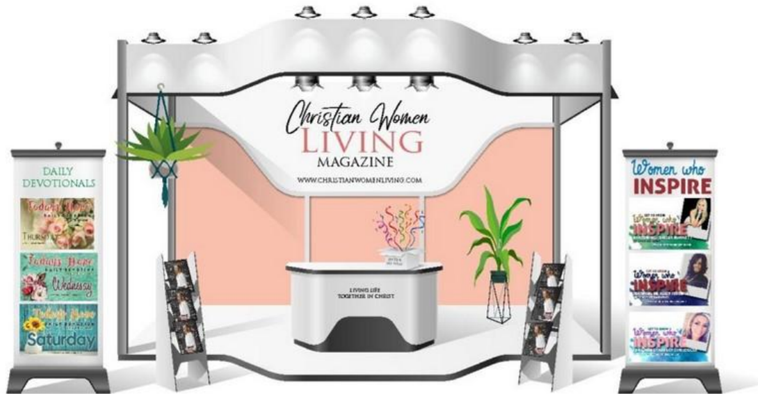
Example of booth after customization